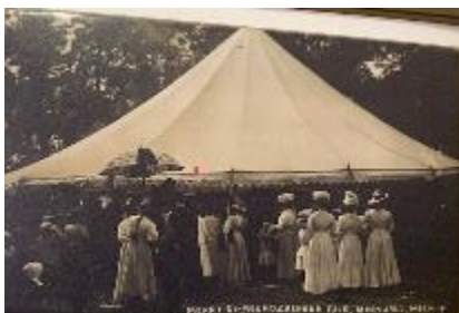
Merry Go-Round at the Calhoun County Fair, Marshall, Mich.