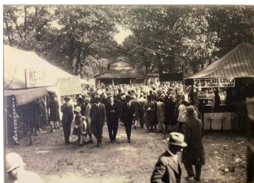
Food booths at the 1928 Calhoun Fair – Marshall, Mich. (Note that the Boys and Girls Annex, now called the Belcher Building, is in the background)