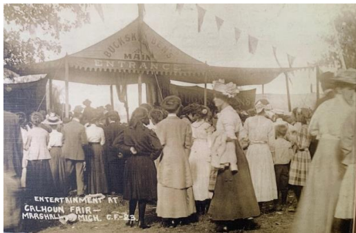
Entertainment at the Calhoun Fair – Marshall, Mich.

The Calhoun County fair was started in 1848 and has been going strong ever since. It's been a wonderful part of Marshall's history from almost the very beginning.